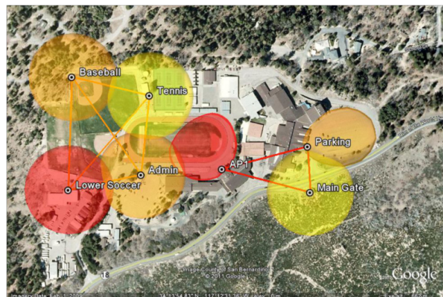
Designers can easily visualize both the Wi-Fi client coverage and the mesh backhaul links.