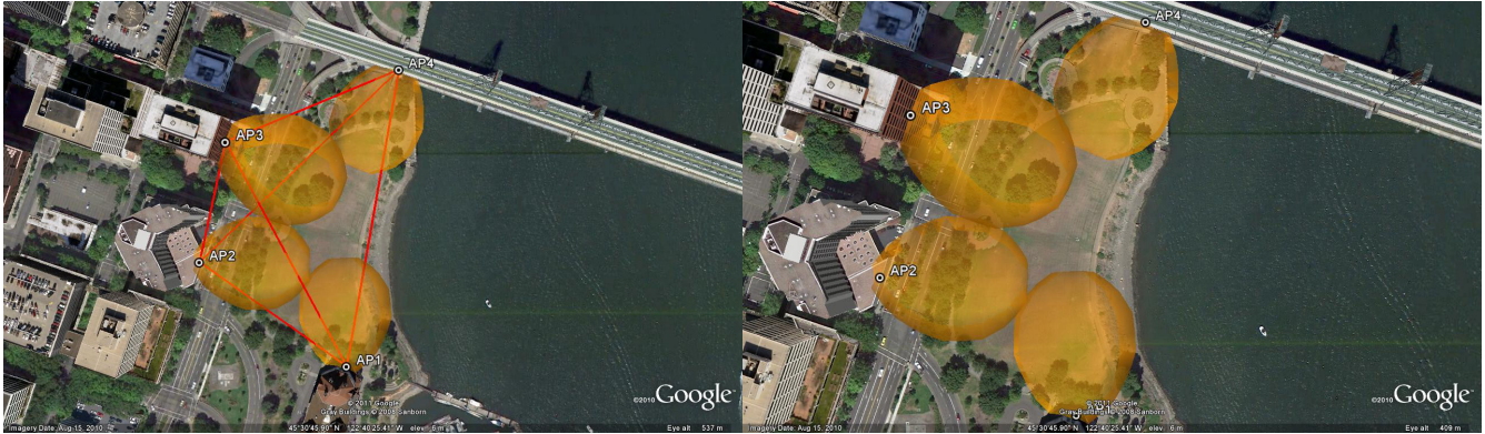
Outdoor RF Planner displays 3D models of the coverage areas by the user-selected 802.11n throughput,

Outdoor RF Planner automatically conducts a series of checks, including verifying each mesh association for valid signal strengths at both ends of the connection, beamwidth alignment, Fresnel zone and earth bulge for long-distance links, and that the associated data rate for the mesh link is above the minimum rate specified.